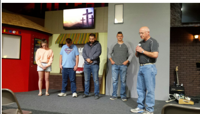
AL prayed for the graduates to be strong in the Lord!