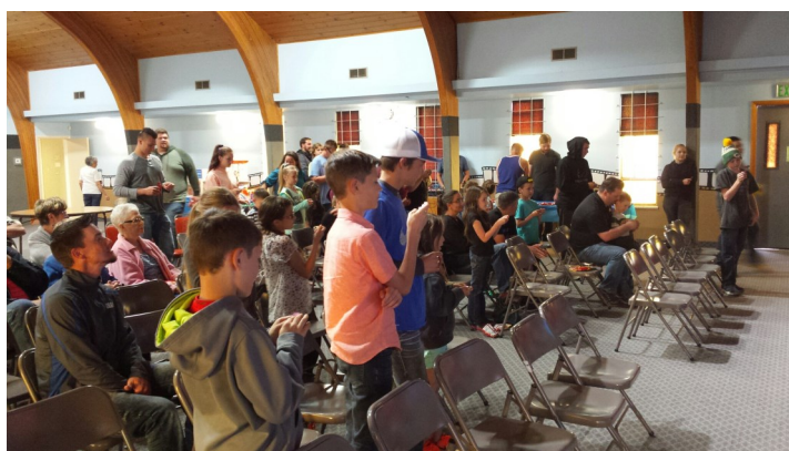
The youth check their tickets for the winning number to win a prize!